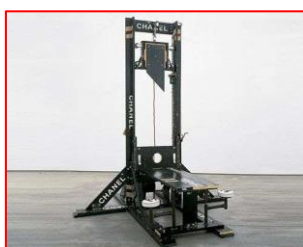
Modern Portable Guillotine manufactured by Chanel

Rev 20:4 And I saw thrones, and they sat on them, and judgment was given to them. And I saw the souls of those who had been beheaded for the witness of Jesus and for the Word of God, and who had not worshiped the beast nor his image, nor had received his mark on their foreheads, nor in their hands. And they lived and reigned with Christ a thousand years. Rev 20:5 But the rest of the dead did not live again until the thousand years were finished. This is the first resurrection. Rev 20:6 Blessed and holy is he who has part in the first resurrection. The second death has no authority over these, but they will be priests of God and of Christ, and will reign with Him a thousand years.